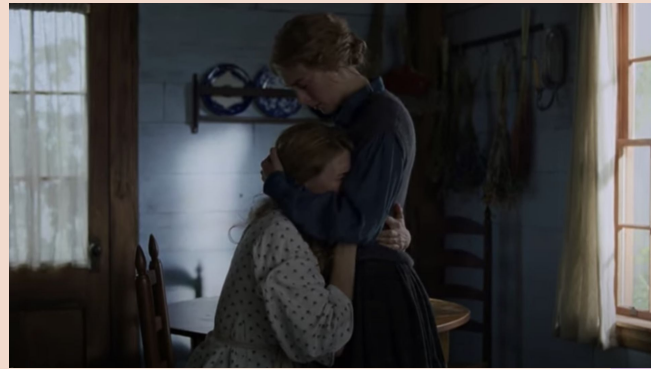
Little Women (2019)