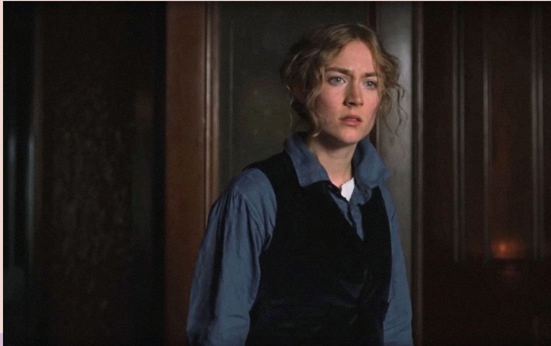
Little Women (2019)