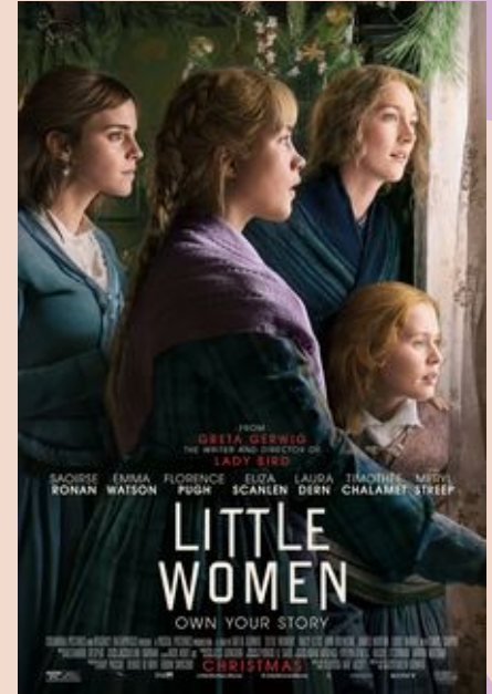
Little Women Movie Poster (2019)

Target Audience: Young adults (due to storyline and actors/actresses)