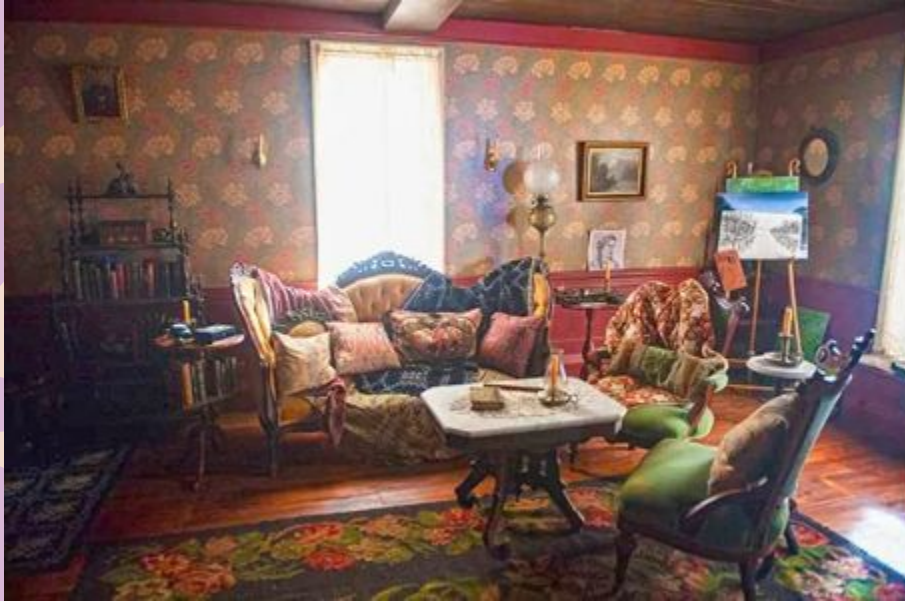
March Family's Set Design