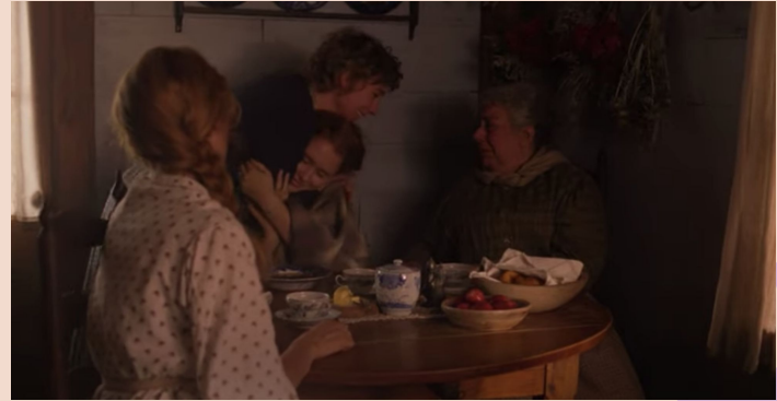
Little Women (2019)