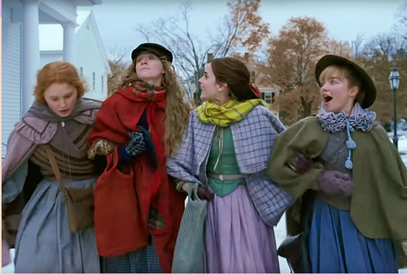
Little Women (2019)