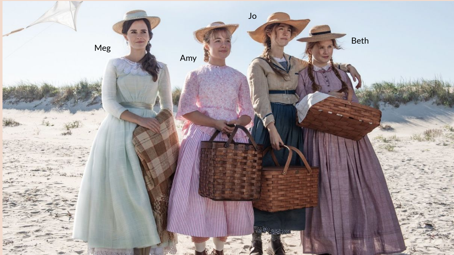
Little Women (2019)